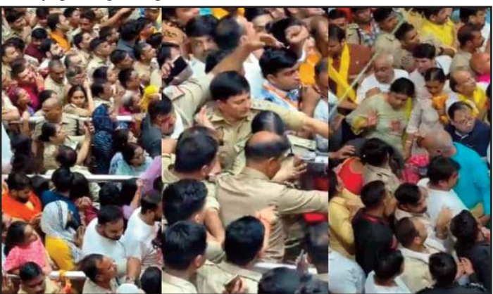
In the video released on social media, policemen trying to take out the crowd stuck ADG

health suddenly deteriorated by getting caught in the