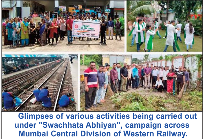
Glimpses of various activities being carried out under "Swachhata Abhiyan", campaign across Mumbai Central Division of Western Railway.

Indian Railways is observing "Swachhata Abhiyan", as part of the ongoing Independence Day celebrations of our nation, and also to reaffirm its commitment to the national cause of cleanliness and public hygiene. This campaign is being observed in two phases, i.e. from 1st to 15th August, 2025 followed by 16th Aug to 31st Oct, 2025. The campaign covers our endeavor towards cleanliness in all spheres of Railway functioning i.e. stations, trains, colonies, offices, depots, and workshops etc, while also promoting awareness among