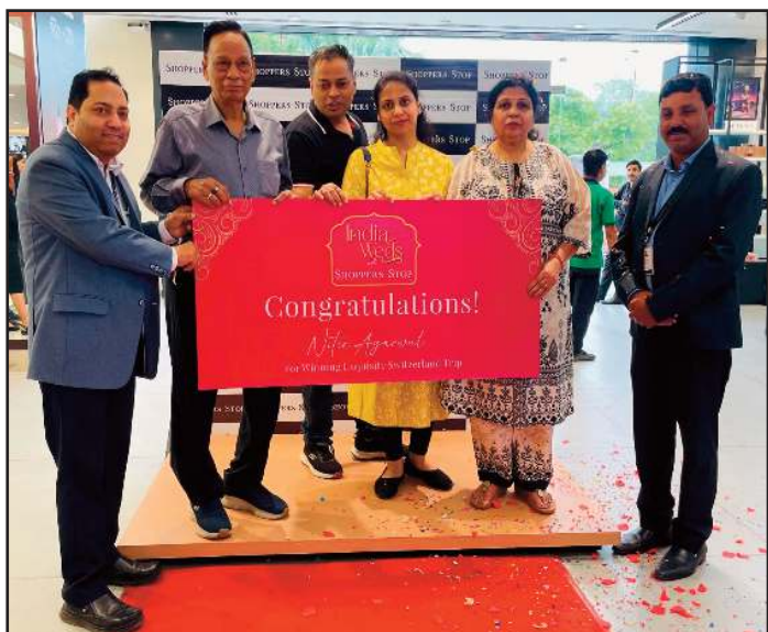
Shoppers Stop Takes Customer Experience Beyond Borders - Sends Top Shopper to Europe!

tribe. From Haldi to Reception, the campaign highlights how the brand walks alongside customers through every step of their wedding journey, offering