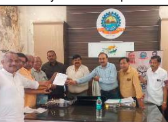
Municipal trade representative board handing over suggestion letter to Additional Municipal Commissioner

Mathura. The city industry trade representative board got a delegation of Mathura, a delegation, met the Additional Municipal Commissioner for the birth system and gave many suggestions in view of the birth festival.