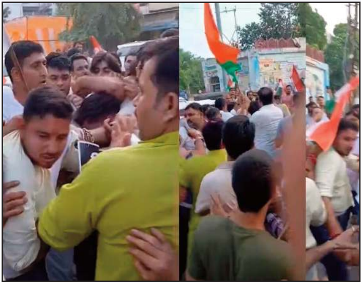
Kick punches scene in viral video

Significantly, on Sunday, the tricolor journey was being taken out in Dhauri Piau Mandal on Maholi Road. Party officials, workers and a large number of supporters were present in the tricolor journey. Meanwhile, two groups got into an argument to be photographed with former Energy Minister Shrikant Sharma. For the first few minutes, it was just a war of words, but in anger, the boiling workers broke on each other. The first argument between the former councilor and the current