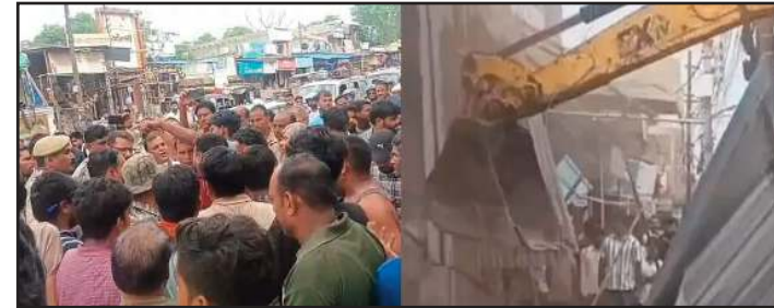
Corporation's team remove encroachment during campaign

completely clean and green as well as major routes are being encroached, so that the situation of the jam does not become."