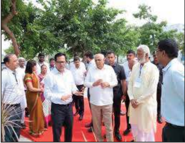
capacity for 3,040 trainees annually, it will offer civil

Gandhinagar, 11 August 2025: Chief Minister Shri Bhupendra Patel, during his visit to Vadnagar, reviewed the ongoing work at the L&T Industrial – Construction Skills Training Institute, built on 37,628 sq. m. of state-allotted land with a 4,000 sq. m. practical yard, will offer technical and vocational training in 14 trades. With a