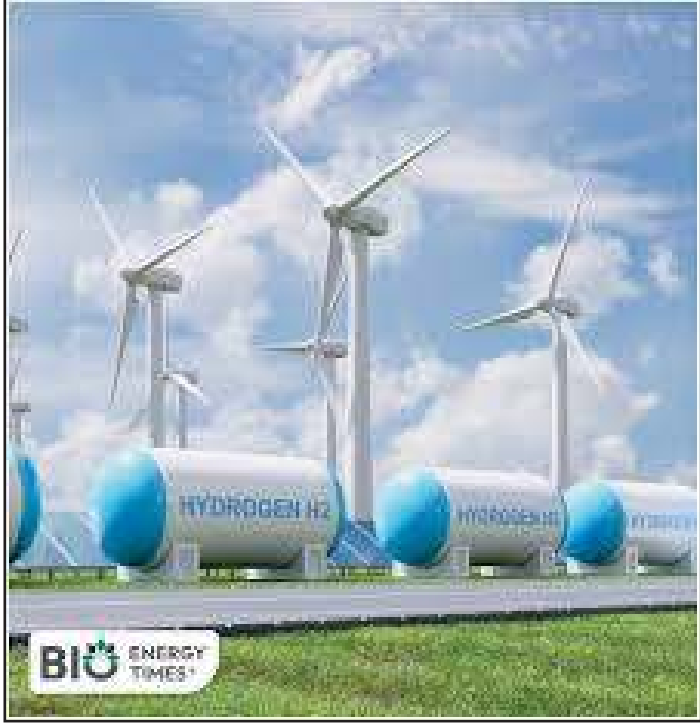
price bid provides strong economic rationale for off-takers to initiate their clean energy transition journey.

India Achieves Green Ammonia Price Breakthrough: Rs. 55.75/kg in SECI's First Auction vs Rs.100.28/kg in 2024 (Gns). In a landmark development under the National Green Hydrogen Mission, the first-ever auction conducted by SECI for the procurement of Green Ammonia under the SIGHT Scheme (Mode-2A) has achieved a record low price discovery of ₹55.75/kg. This pioneering auction covers the supply of 75,000 metric tonnes per annum of Green Ammonia to Paradeep Phosphates Limited, Odisha. It is the first in a planned series of 13 auctions over the coming month, under a tender aggregating a cumulative procurement capacity of 7.24 lakh MT/year. The discovered price translates to approximately USD 641/MT, a substantial drop from the previously discovered price of ₹100.28/kg (USD 1,153/MT) in the H2Global auction in 2024. With Grey Ammonia prices reaching USD 515/MT (as of March 2025), this 10-year fixed-price bid provides strong economic rationale for off-takers to initiate their clean energy transition journey. SECI, acting as the intermediary procurer, has successfully anchored the