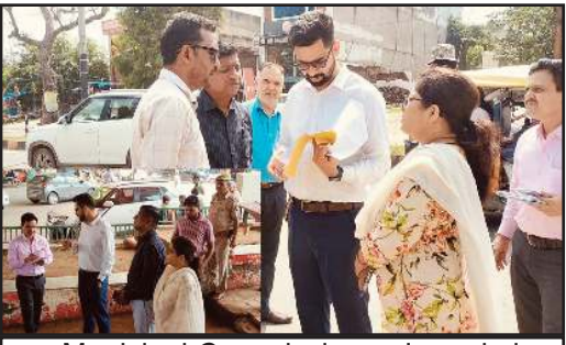
Municipal Commissioner Jag admission inspection during inspection

Mathura. The Municipal Corporation has gathered rapidly in the preparations for special arrangements in Shri Krishna Janmashtami festival metropolis. Municipal Commissioner Jag Pravesh Nagar is inspecting wards and major routes regularly to maintain all major arrangements including cleanliness, drainage, patchwork, cleaning lighting of drains, beautification. Ward number 28 (Aurangabad II) was inspected by Municipal Commissioner Jag Pravesh on Wednesday. During the inspection, cleaning, patchwork and attendance register were observed in the ward. He gave instructions for immediate tamilization and repair if the pit was found in the road at the Gokul Barrage turn. 4 out of the ward, 4 employees were found absent and 1 employees were found absent for three months continuously. Instructions were given to deduct salary on absent employees and remove 01 absent employees from service. After this, the Municipal Commissioner reached ward number 32 (Ranchi Bangar) where he