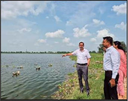
Instructions and inspection to the District Magistrate Subordinates