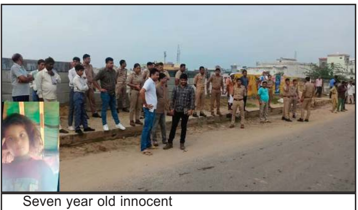
Seven year old innocent